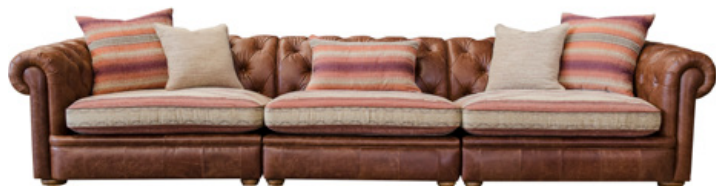
MAXI XL SOFA

Our signature Chesterfield collection in rich velvets and warm wools and smooth leathers. Available in a variety of fabrics and leathers.