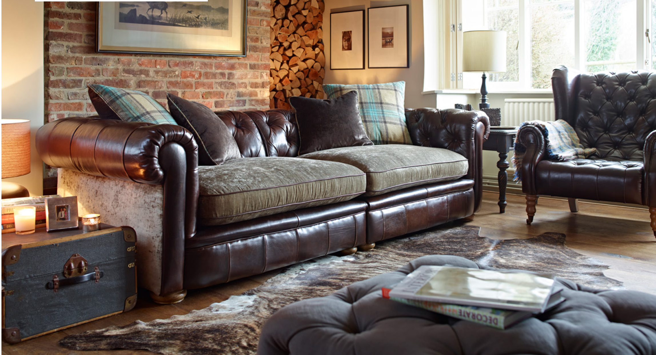
FRANKLIN MAXI SOFA IN BYRON BROGUE & PASTICHE SAGE WITH WEATHERED OAK FEET

Alexander & James GREAT BRITISH SOFA DESIGN