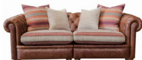
MIDI SOFA SPLIT