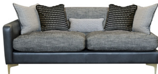
DOUBLE END UNIT L/R