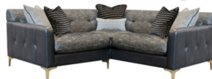
2 PIECE CORNER