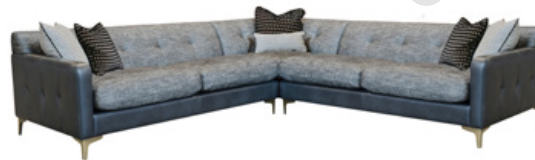
3 PIECE CORNER