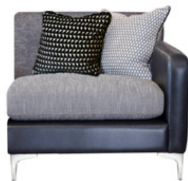
END UNIT R