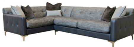
2 PIECE LH