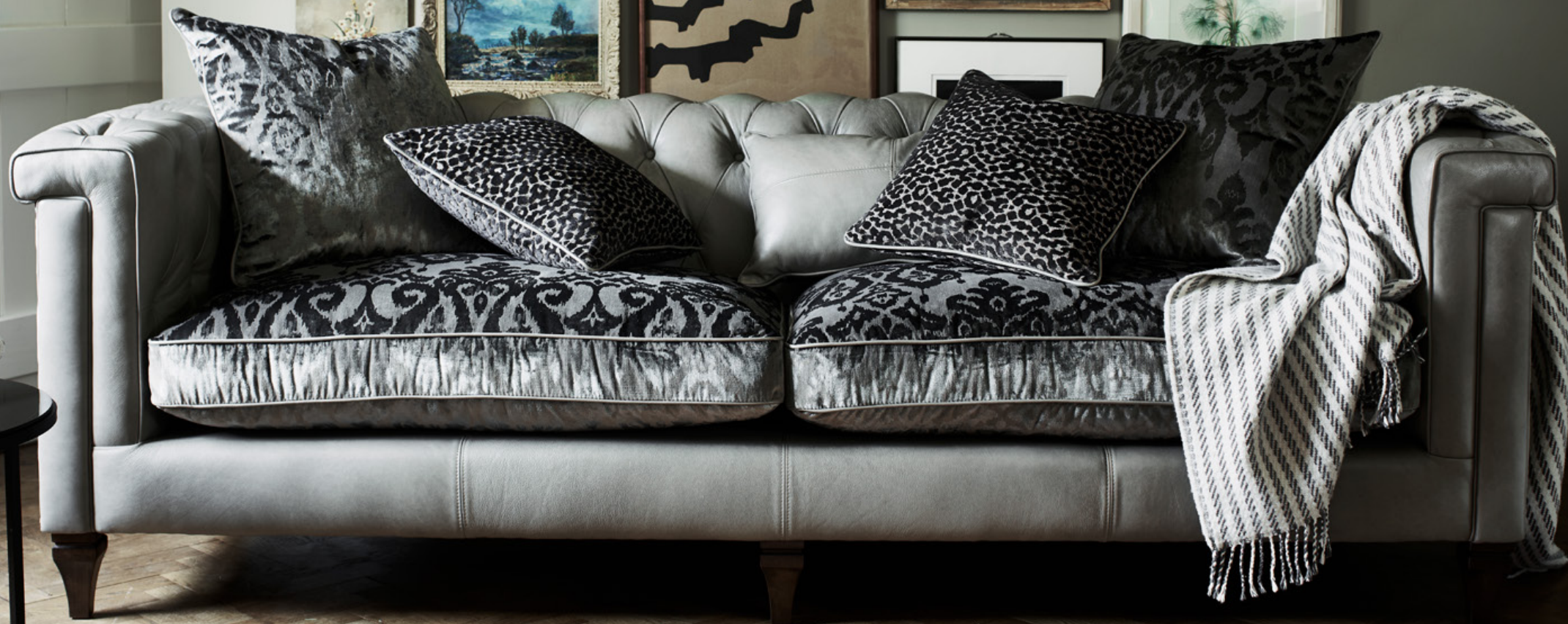
ISABEL MAXI SOFA SHOWN IN TOTE STORM LEATHER WITH FABRIC OPTION 1 WITH DARK WOOD FEET