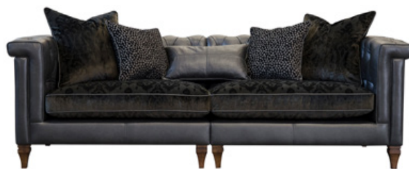
MAXI SPLIT SOFA

SHOWN IN TOTE NIGHT LEATHER WITH FABRIC OPTION 3