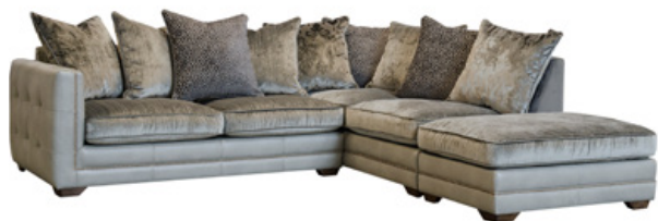
3 PIECE CORNER UNIT

Luxurious fabrics for a soft and sumptuous feel. This elegant square armed collection features hand studding detail which adds the perfect vintage flavour. Generously proportioned and a real statement piece.