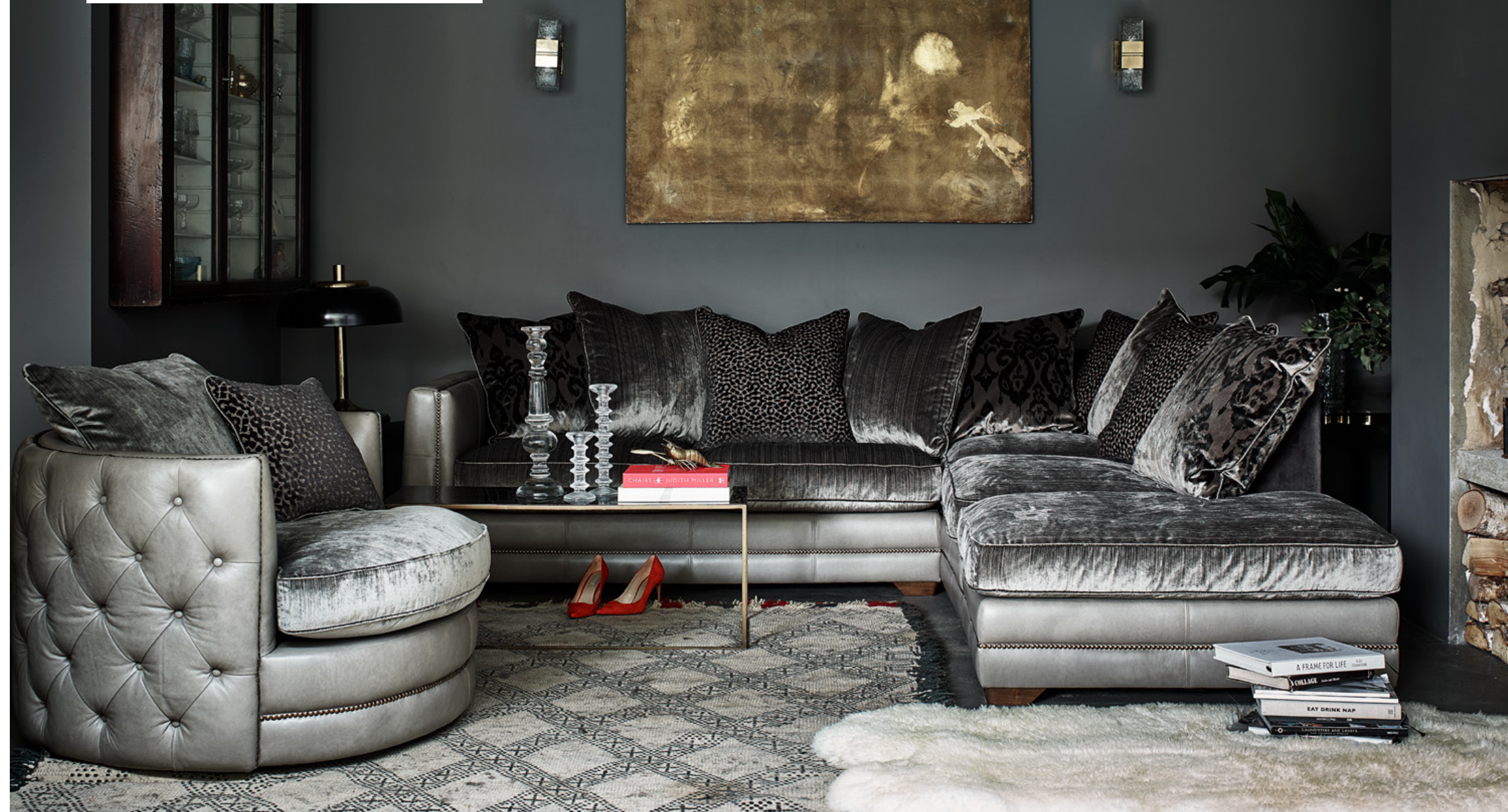
BELUSHI 3 PIECE CORNER PILLOW BACK AND TWISTER CHAIR SHOWN IN TOTE STORM LEATHER WITH FABRIC OPTION 1, WITH DARK WOOD FEET

Alexander & James GREAT BRITISH SOFA DESIGN