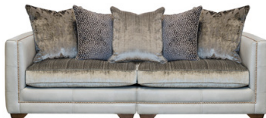
MAXI SPLIT SOFA

SHOWN IN TOTE STORM LEATHER WITH FABRIC OPTION 1