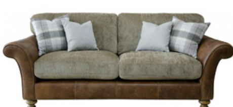
3 SEATER SOFA

SHOWN IN INDIANA TAN WITH FABRIC OPTION 1