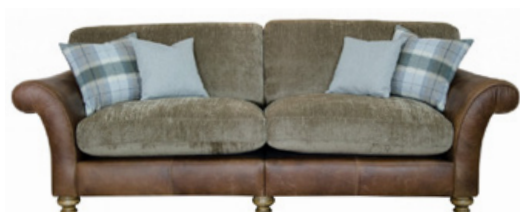
4 SEATER SOFA

SHOWN IN INDIANA TAN WITH FABRIC OPTION 1