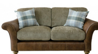
2 SEATER SOFA

SHOWN IN INDIANA TAN WITH FABRIC OPTION 1