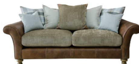
3 SEATER SOFA

SHOWN IN INDIANA TAN WITH FABRIC OPTION 1