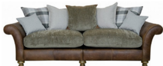
4 SEATER SOFA

Character leather sofa with cosy woven seats. Accent with our Eltham Check or Plaid cushions. Available in a variety of leather and fabric combinations.