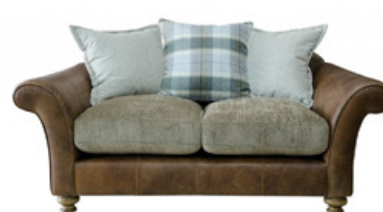
2 SEATER SOFA

SHOWN IN INDIANA TAN WITH FABRIC OPTION 1