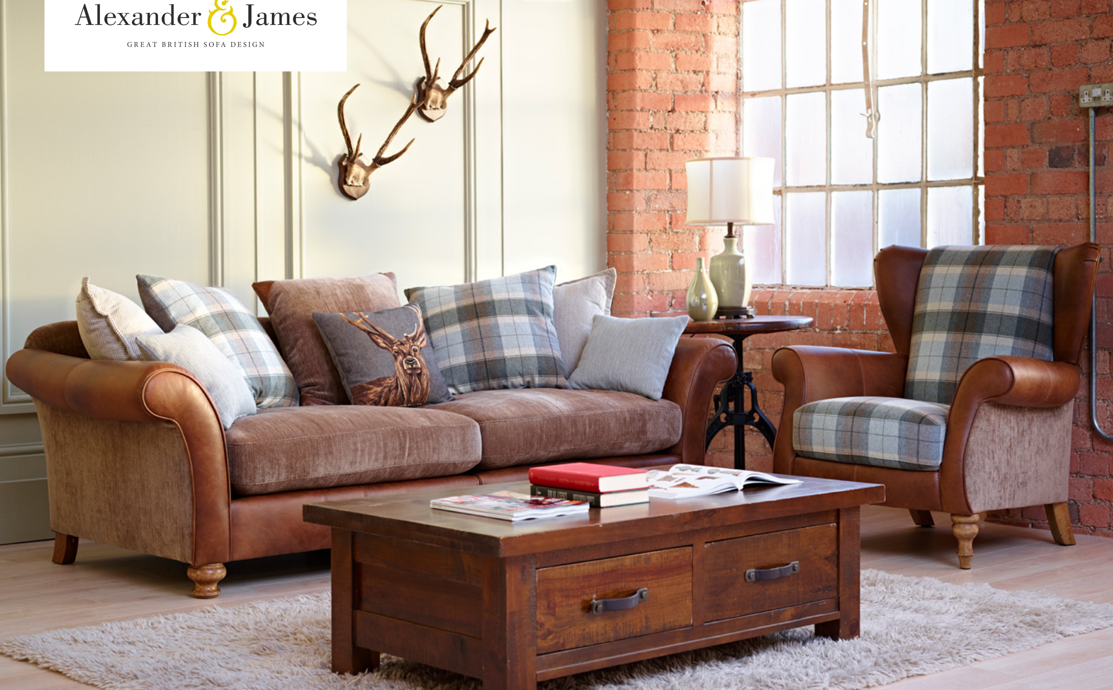
LAWRENCE 4 SEATER PILLOW BACK IN INDIANA TAN LEATHER WITH OPTION 4, WITH WEATHERED OAK FEET

Alexander & James GREAT BRITISH SOFA DESIGN