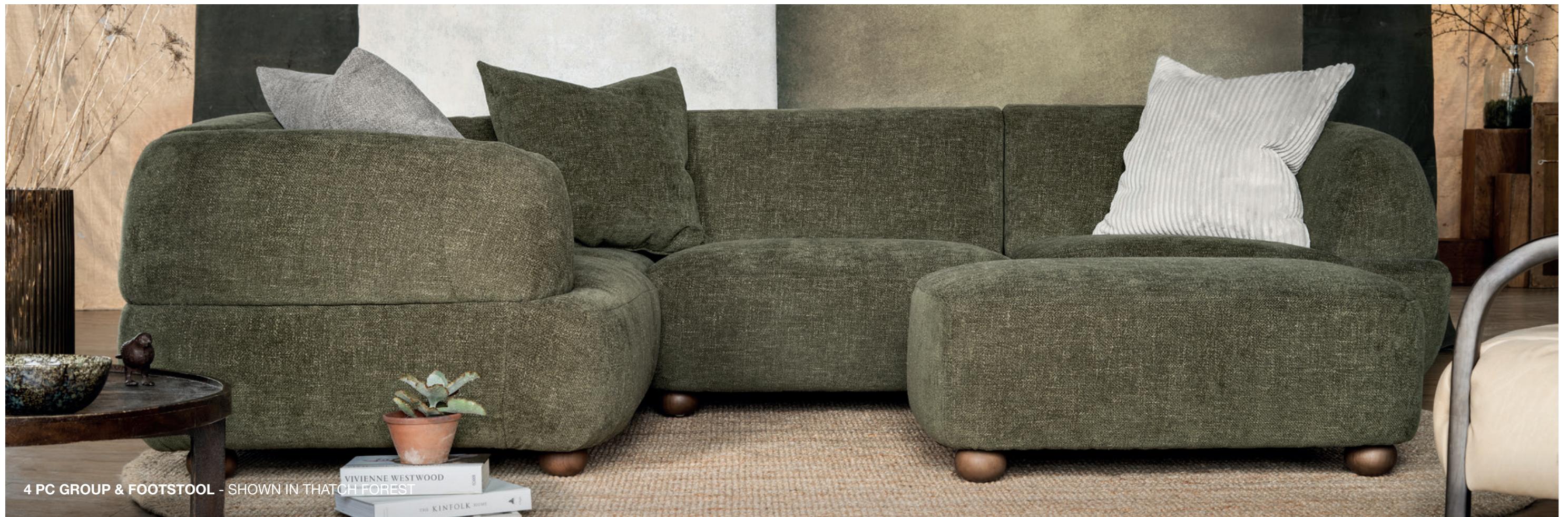
4 PC GROUP & FOOTSTOOL - SHOWN IN THATCH FOREST

Bubble's clean lines and scale create a strong profile which balances nicely with the playful curves and soft shape, combining with minimal seam detailing and fun spherical solid timber feet for a super smooth, uninterrupted, sculpted look.