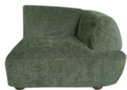
RHF Single Unit