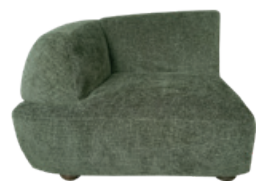
LHF Single Unit