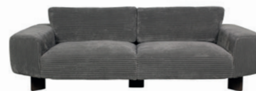
2 Seater Split