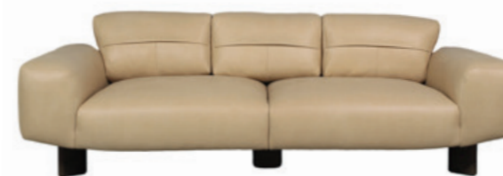
2 Seater Split