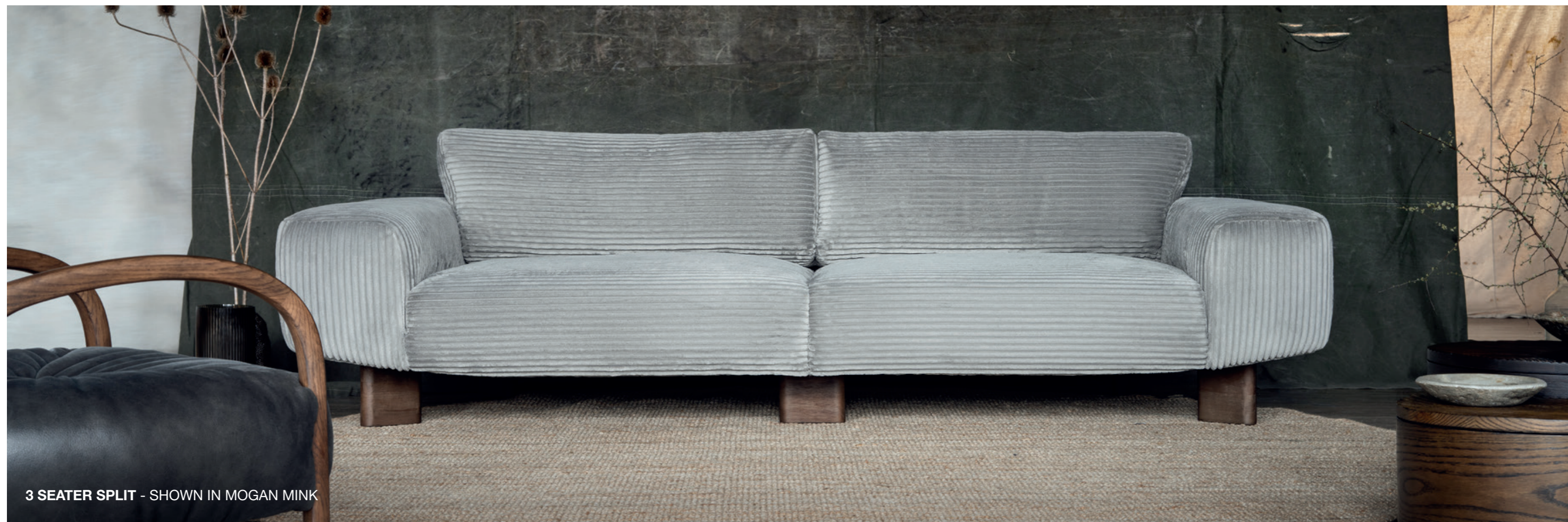
3 SEATER SPLIT - SHOWN IN MOGAN MINK

Modern and sophisticated, soft bevelled lines create a low-slung, retro profile. Kayak offers a truly comfortable and supportive sit, with many beautiful elements, from the unique cylindrical oval feet to the wide arms. The details truly make the difference.