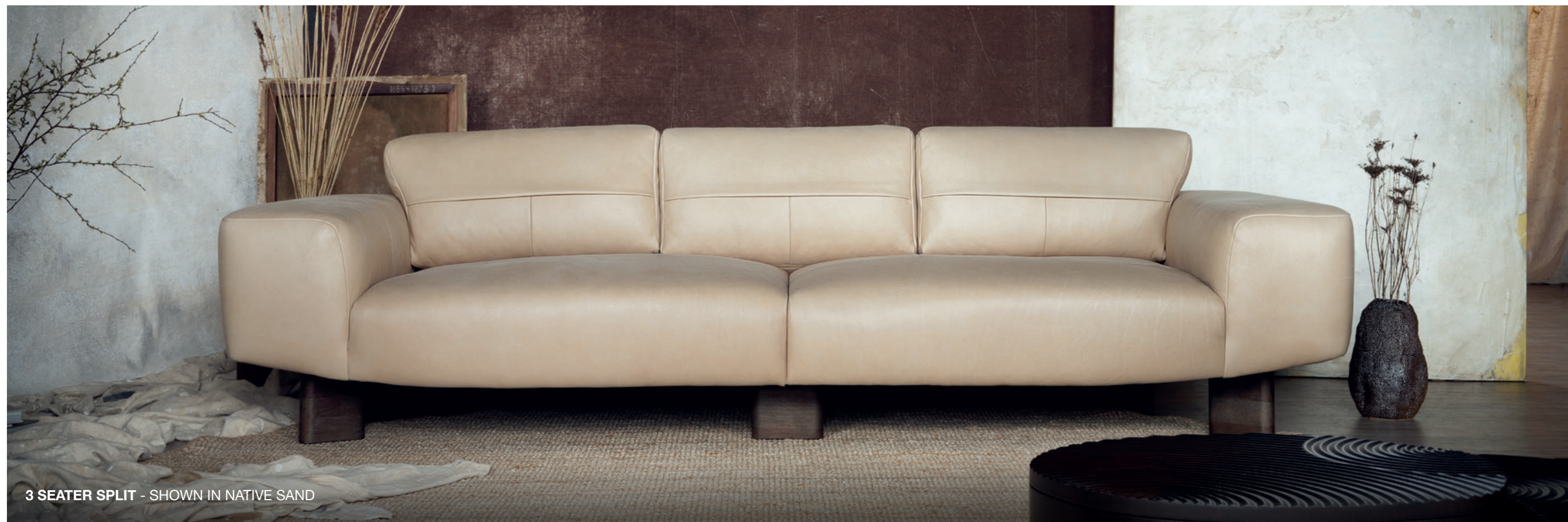
3 SEATER SPLIT - SHOWN IN NATIVE SAND

Modern and sophisticated, soft bevelled lines create a low-slung, retro profile. Kayak offers a truly comfortable and supportive sit, with many beautiful elements, from the unique cylindrical oval feet to the wide arms. The details truly make the difference.